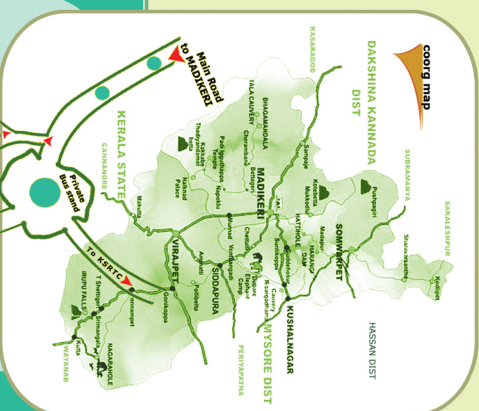
The way to HILLTOWN

Coorg is the blessed land that has given generals like K.M.Kariappa, K.S.Thimmayya and many more brave soldiers and thus is named the "LAND OF GENERALS". Known as "The coffee bowl of India", the Coorg is one of the most enthralling hill stations of India. More often than not, people from all parts of India and abroad visit Coorg and become a part of the cultural heritage. They take back with them the unique culture that they have experienced. Coorg is a place visually as stunning as Scotland, Switzerland, Kashmir of south India all rolled in to one.