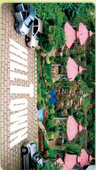
Rock garden with waterfall

There is a state of art garden and parking slots, just in front of our hotel. This houses a few sit-outs, artificial water falls, and a variety of ornamental plants that gives a tranquil garden retreat. The guests can have an ideal break from noisy pollution and monotonous city life. They can enjoy the cool, fresh breezes of MADIKERI.