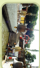
The Birth Place of River CALIVERY

HILLTOWN HOTEL HILLTOWN ROAD, MADIKERI 08272229479, 223801, 223802, 223803. cell: 09448184625, fax: 08272223805. e-mail: hilltown@rediffmail.com, info@hilltownhotel.com www.hilltownhotel.com,