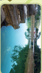
The attraction SANGAMA (where Yamula, Noyya)